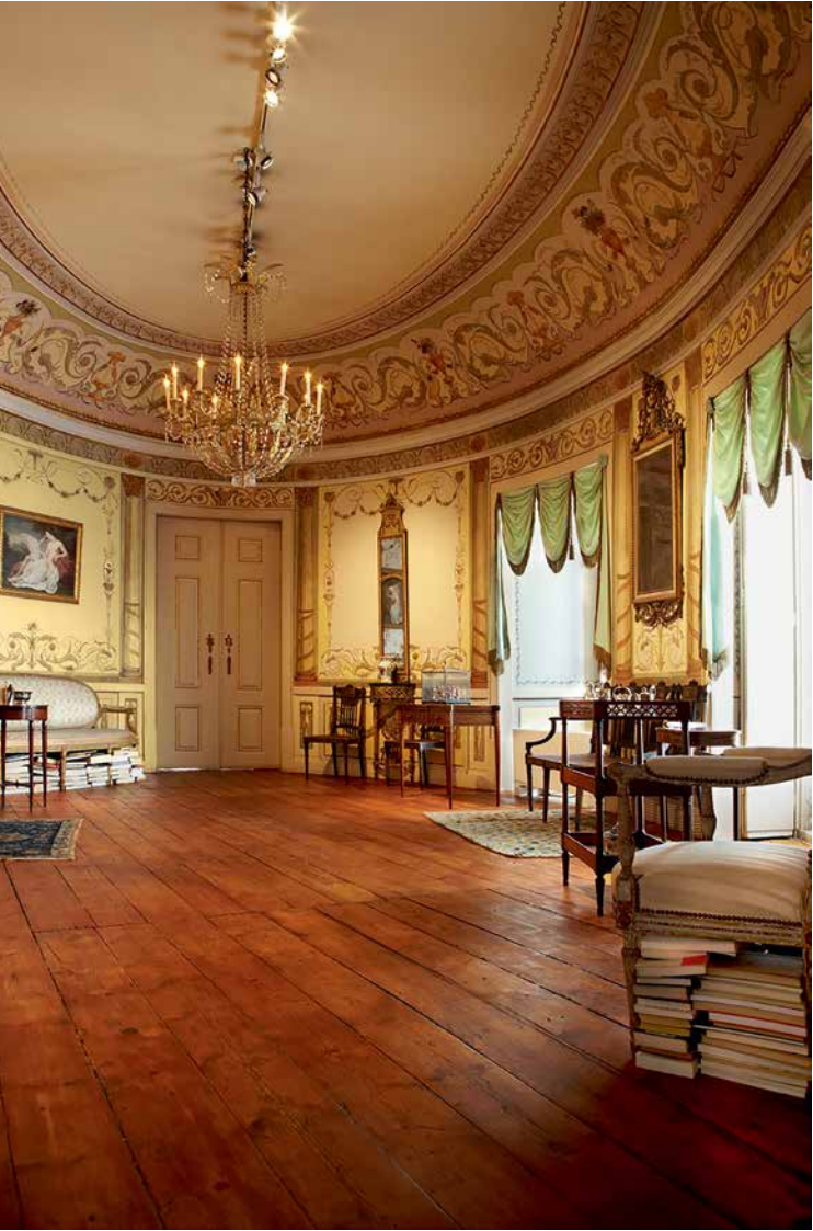
OPPOSITE • Sofia Leitão Matéria do esquecimento (Forgetfulness Matter), 2011 • Books, sequins, steel pins, foam, wire and black leatherette 256 × 190 × 130 cm (100¾ × 74¾ × 51½ in.)